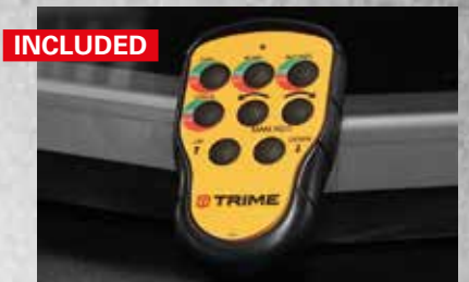
R.O.T. SYSTEM Automatic Oscillation 340 °